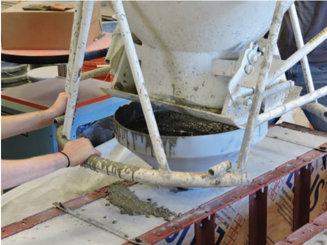
Figure 4. Repair Material Placement