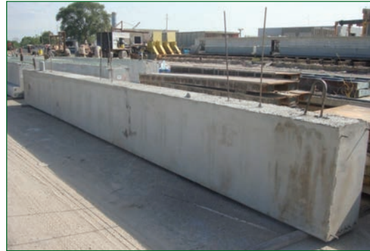
Figure 1: Left: casting of beam 3. Right: beam 5 with three sets of prestress strands

Dynamic segregation of self-consolidating concrete (SCC) can lead to the separation of coarse aggregates from the suspending mortar during flow, resulting in an inhomogeneous distribution of the constituents which can affect the performance of the produced element. In recent studies, a characterization device, called the tilting box or T-box, was developed by Esmailkhanian et al. at the Université de Sherbrooke. Laboratory studies at Missouri S&T have further revealed the influence of SCC mix design and rheological parameters on dynamic segregation. However, the distinction between “segregating” and “non-segregating” concrete was based on principles of static stability and has not been validated. The purpose of the second part of this project, described below, is to investigate the upper limit of dynamic segregation evaluated from the T-box that does not negatively affect performance of the structural element.