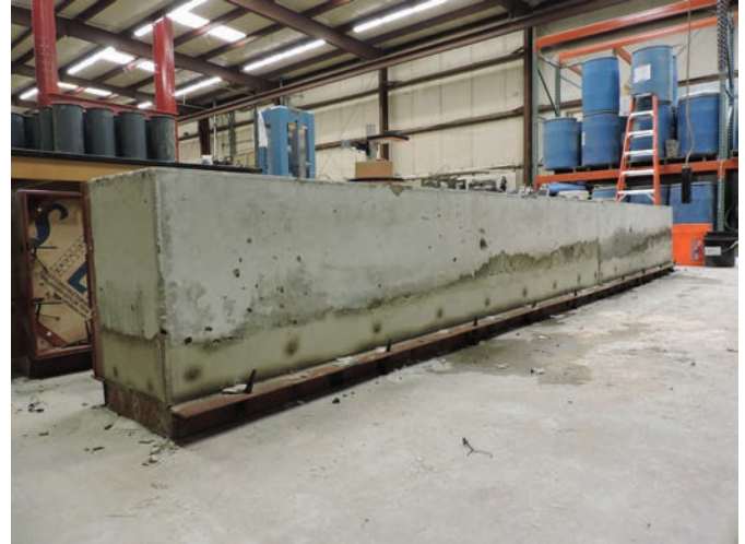
Figure 5. Completed Beam Specimens

Figures 4 and 5 show the repair material placement and a completed beam specimen after form removal, respectively. Testing of the beams is scheduled for late April.