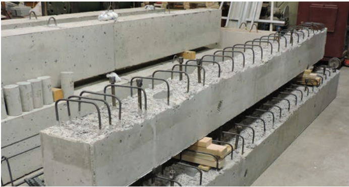
Figure 1: Casting of two sets of partial beams, three beams per set

Following a hydro-demolition phase to clean the surface and expose the underlying aggregate, the partial beams were rotated right-side up for installation of the flexural reinforcement and strain gages, as shown in Figure 2 . The beams were then placed within the formwork, as shown in Figure 3 , in preparation for casting the repair material.