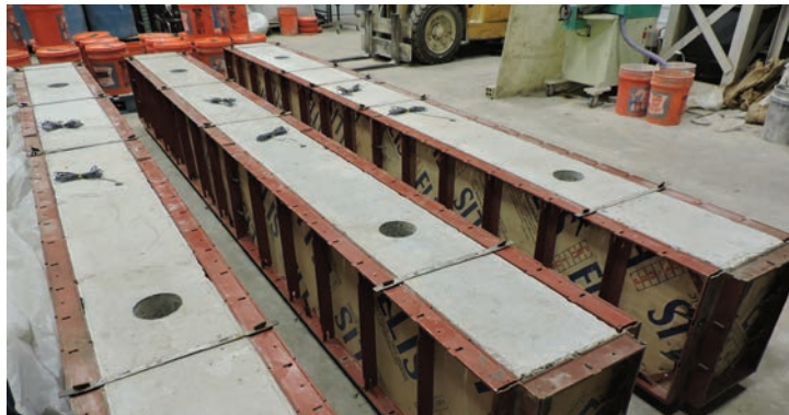
Figure 3: Beams placed within formwork